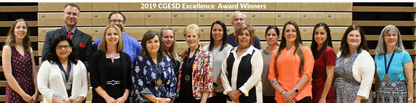
2019 CGESD Excellence Award Winners